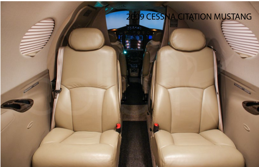
2009 CESSNA CITATION MUSTANG